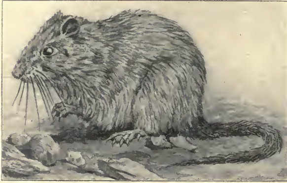
FIG. XXXIII.—NEOTOMA MICROPUS. SMALL-FOOTED WOOD RAT.

M. Pub., IV, Pt. I, 1904, p. 281, figs. 45, XLIII. Zoöl. Ser. Id. Check-L. Mamm. N. Amer. Cont. & W. Indies, F. C. M. Pub., VI, 1905, p. 208. Zoöl. Ser.